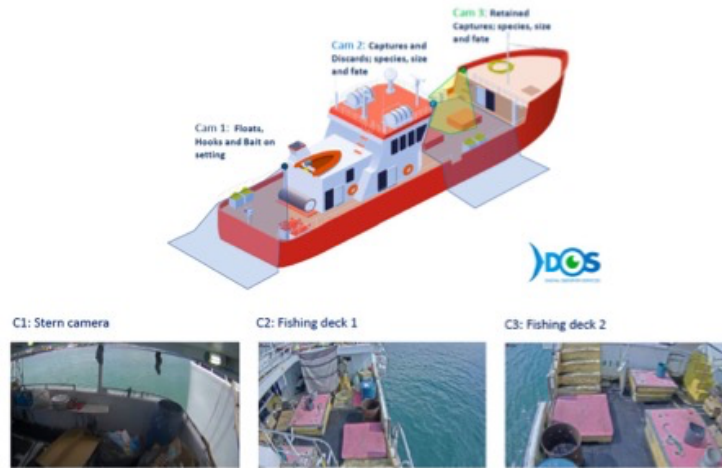
Figure 2 - 3-camera EM equipment installed on a longline covering main areas of fishing and fish handling operations. View of the 3 cameras: (left panel) Stern camera - setting longline providing information on hooks, floats, mitigation techniques and bait; (middle panel) Fishing deck 1 - hauling information, captures and discards, species ID, size and fate; and (right panel) Fishing deck 2 - fate of the species, size, species ID.

The vessel should prove that the EM system has been customized to the vessel to collect the required data on fishing activities, as described above (and summarized in Tables 2 and 3).